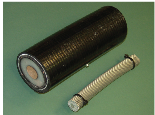
Underground cable and smaller overhead conductor.