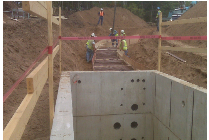
Crews work on an underground duct bank extending from a typical 8'x8'x24' vault

Overhead lines are air cooled and widely spaced for safety. Underground cables are installed in concrete encased PVC duct banks. Heat generated by the cables is dissipated through the earth to the surface.